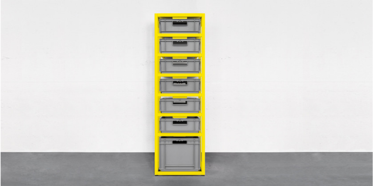
Storage Tower 2012

Storage made of tubular steel 3 x 3 cm with 7 or 4 industrial plastic boxes guided in rails and held in open inclined position by tilt stops above